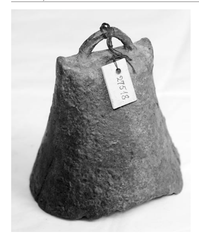
Fig. 1 Viking Age iron bell from Flatland, Hjartdal, Telemark Co., Norway (C27518). Length without striker: 9.1 cm. Largest width: 8.2 cm.