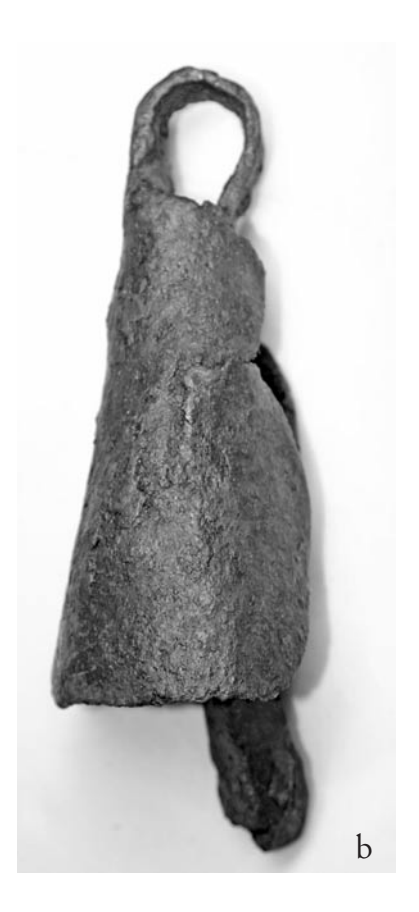
Fig. 3 a-b: Viking Age iron bell from Liberg, Vang, Hedemark Co., Norway (C25952a). Length without striker: 12.6 cm. Largest width: 6.2 cm.