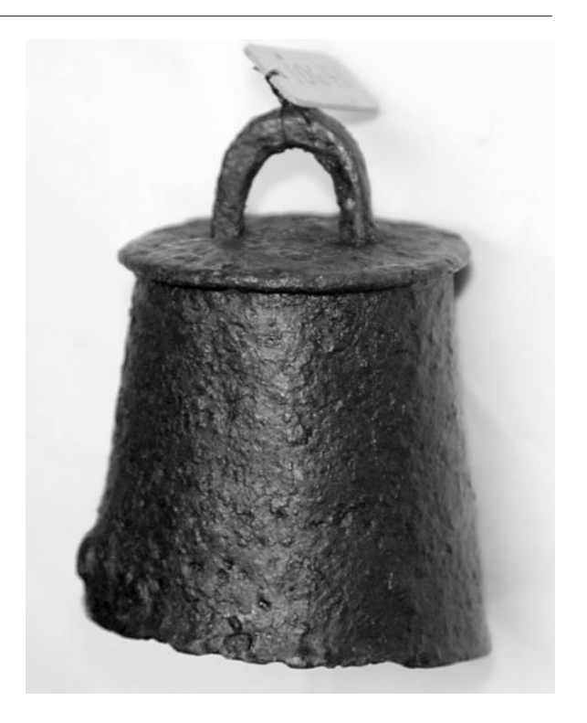
Fig. 2 Viking Age iron bell, unprovenanced, Eastern Norway (C10461).Length without striker: 6.1 cm. Largest width: 4.7 cm.