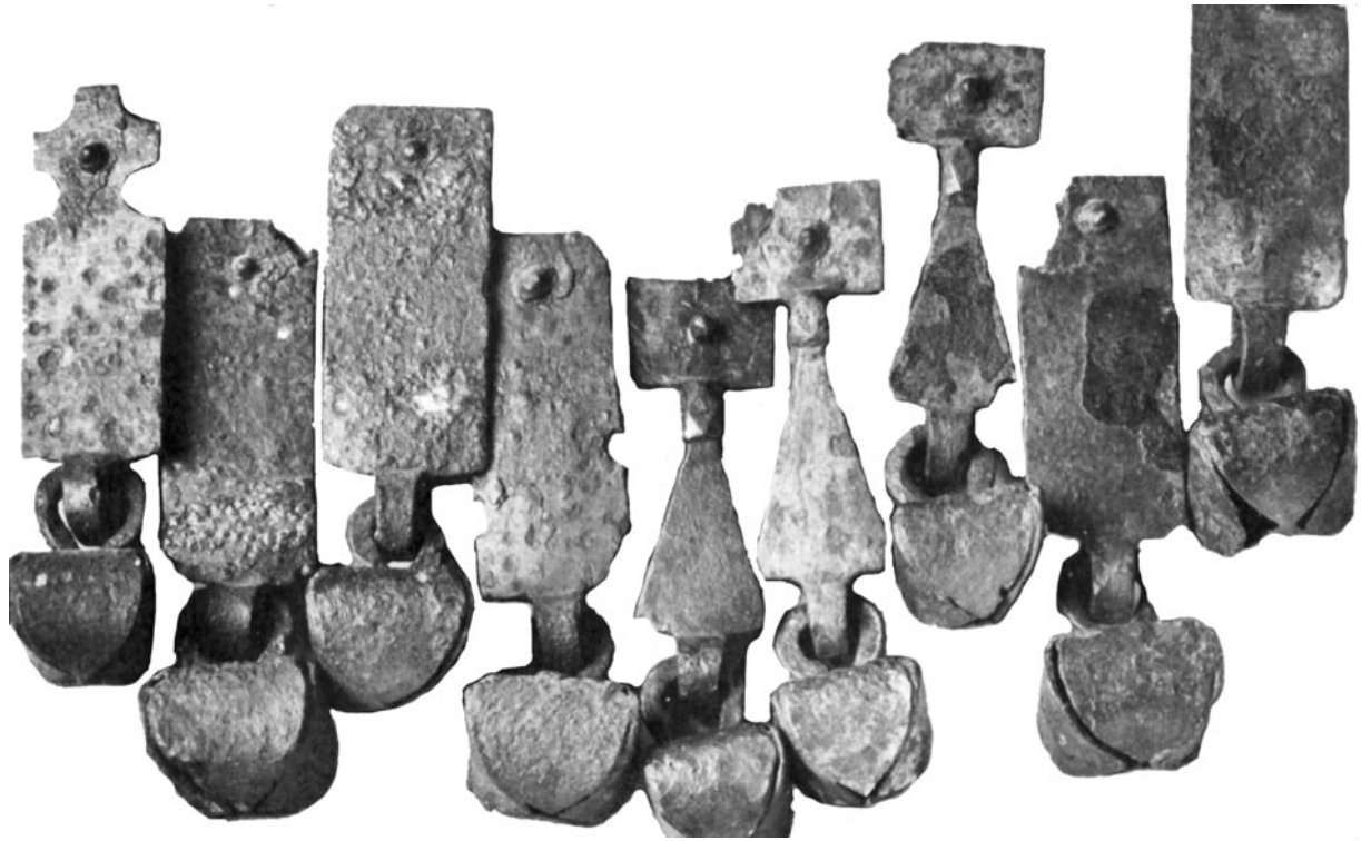
Fig. 4 Crotal iron bells with strap mountings from a Viking Age grave find at Raglunda, Västmanland Co., Sweden (from Lund 1991, 55). The bell second from the left measures about 3 x 2.2 cm.