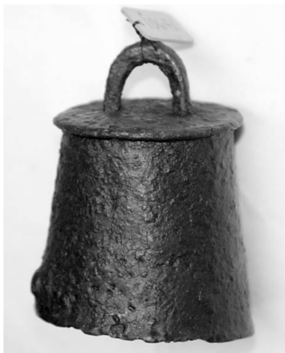
Fig. 2 Viking Age iron bell, unprovenanced, Eastern Norway (C10461). Length without striker: 6.1 cm. Largest width: 4.7 cm.