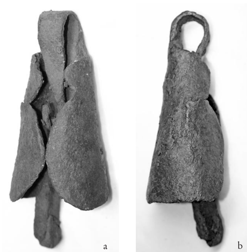
Fig. 3 a–b: Viking Age iron bell from Liberg, Vang, Hedemark Co., Norway (C25952a). Length without striker: 12.6 cm. Largest width: 6.2 cm.