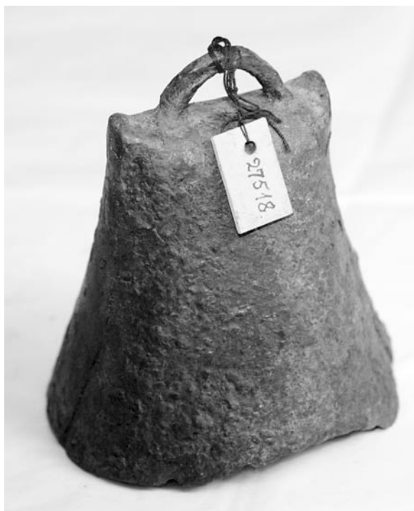
Fig. 1 Viking Age iron bell from Flatland, Hjartdal, Telemark Co., Norway (C27518). Length without striker: 9.1 cm. Largest width: 8.2 cm.